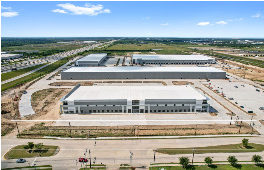
LONE STAR LOGISTICS PARK

New Construction 79,072 sf (divisible) industrial distribution building for sublease in Southeast Houston, TX. Primary term runs through 2033. TI Available.