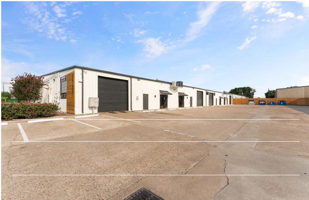
MULTI-TENANT OFFICE/WAREHOUSE PARK

Fully renovated multi-tenant business park offers suites from 2,000 to 6,000sf+, options for paved outside, fenced and gated storage, and suites with modern office finishes.